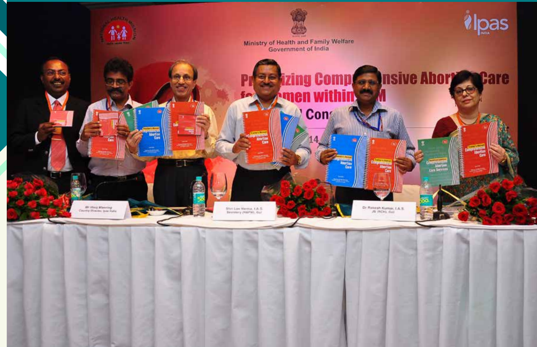
Release of the National CAC Training package at the National Consultation on Prioritizing Comprehensive Care for Women within NHM, May 19-20, 2014 by the Secretary (Health and Family Welfare), Joint Secretary (Reproductive and Child Health) and technical officers of the Maternal Health Division, MOHFW, Government of India.

Responding to another key requirement that was highlighted in the consultation in May, the MoHFW invited IDF to lead a consultative process of drafting and disseminating a critical guidance detailing strategies for ensuring access to safe abortion services and addressing gender biased sex selection in the country. The handbook was released in 2015, and is intended to provide clarity to implementing authorities about the provisions of the MTP and The Pre-Conception and Pre-Natal Diagnostic Techniques Act; information to service providers on compliance with the Laws and guidance on planning; and guidance to government and civil society on executing effective communication on the two issues